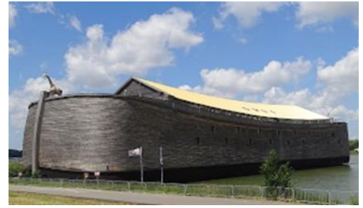
“A replica of Noah’s Ark in Dordrecht, The Netherlands”

The Pentateuch, The Navarre Bible (1999, Verbum electronic version), p. 72.