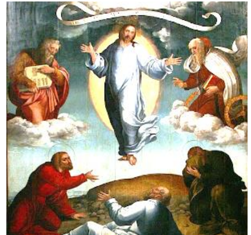
Image © José Luiz Bernardes Ribeiro, 2013, cropped, (commons.wikimedia.org/wiki/File:Transfiguration_of_Jesus_Christ_-_Museu_Nacional_de_Arte_Antiga.jpg) CC BY-SA 3.0.

Archbishop Fulton Sheen, Life of Christ (Image Books, 1990), pp. 160-161.