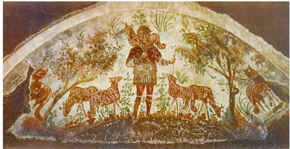
The Good Shepherd, from the Domitilla catacombs, mid 4 th century AD (slightly retouched).