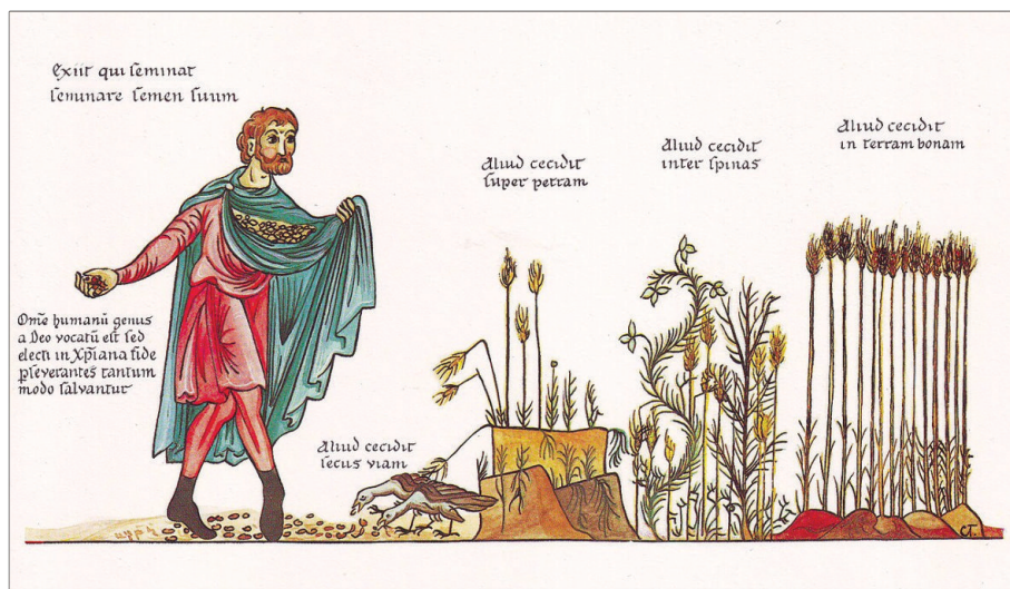
Image: "The parable of the sower" by Sr. Herrad of Landsberg (1130-1195 AD).