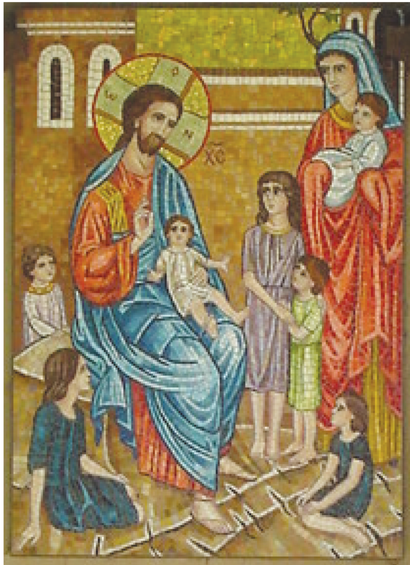
Icon of Christ and the Little Children, Saint Tikhon's Monastery, South Canaan

“I bless You, Father, Lord of heaven and of earth, for hiding these things from the learned and the clever and revealing them to little children” (Matthew 11:25).